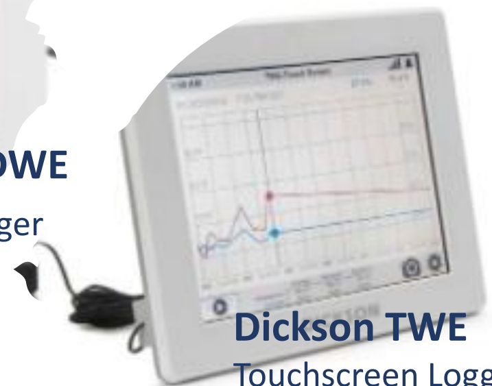
Dickson TWE Touchscreen Logger