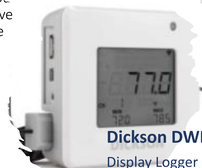
Dickson DWE Display Logger